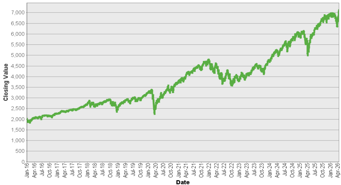
S&P 500® Index – Historical Closing Values January 4, 2016 to April 17, 2026

The graph below shows the closing value of the S&P 500® Index for each day such value was available from January 4, 2016 to April 17, 2026. We obtained the closing values from Bloomberg L.P., without independent verification. You should not take historical closing values as an indication of future performance.